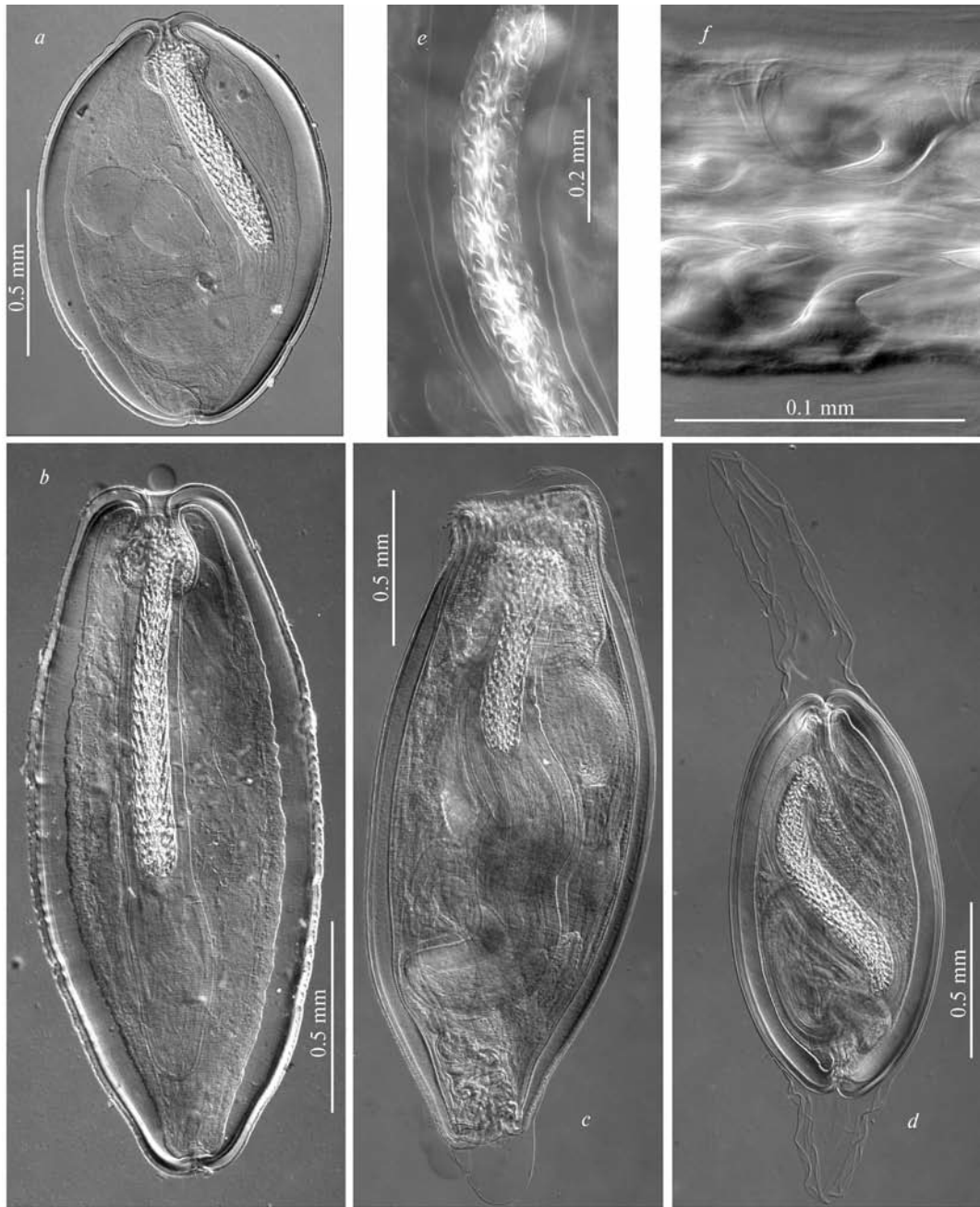
Fig. 2. Photographs of cystacanths from the body cavity of Orchestia sp.: a — Plagiorhynchus odhneri , ♂; b — Plagiorhynchus odhneri , ♀; c — Southwellina hispida ; d — Arhythmorhynchus invaginabilis ; e, f — case of teratism in the structure of hooks in Plagiorhynchus odhneri .

Рис. 2. Фотографии цистакантов из полости тела Orchestia sp.: a — Plagiorhynchus odhneri , ♂; b — Plagiorhynchus odhneri , ♀; c — Southwellina hispida ; d — Arhythmorhynchus invaginabilis ; e, f — случай уродства в строении крючков Plagiorhynchus odhneri .