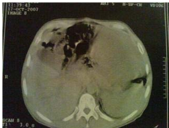
Figure 1. CT scan of abdomen: heterogeneous mass 285x207 mm.