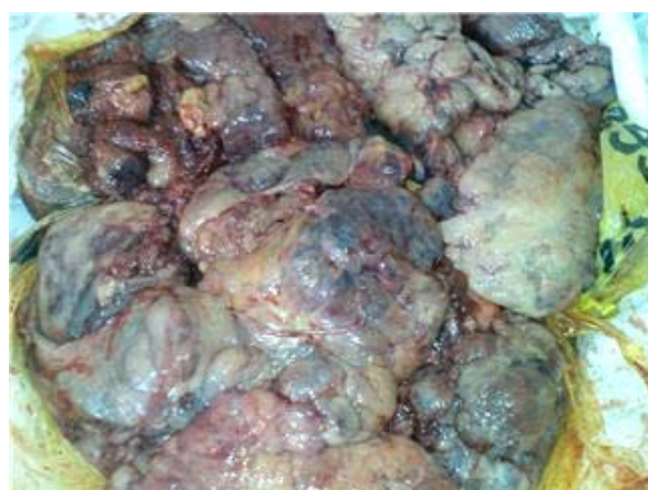
Figure 2. 38 kilogram retroperitoneal tumor.