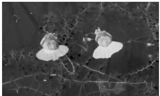
Fig. 2. Utricularia australis in a clay quarry near Barashivka village