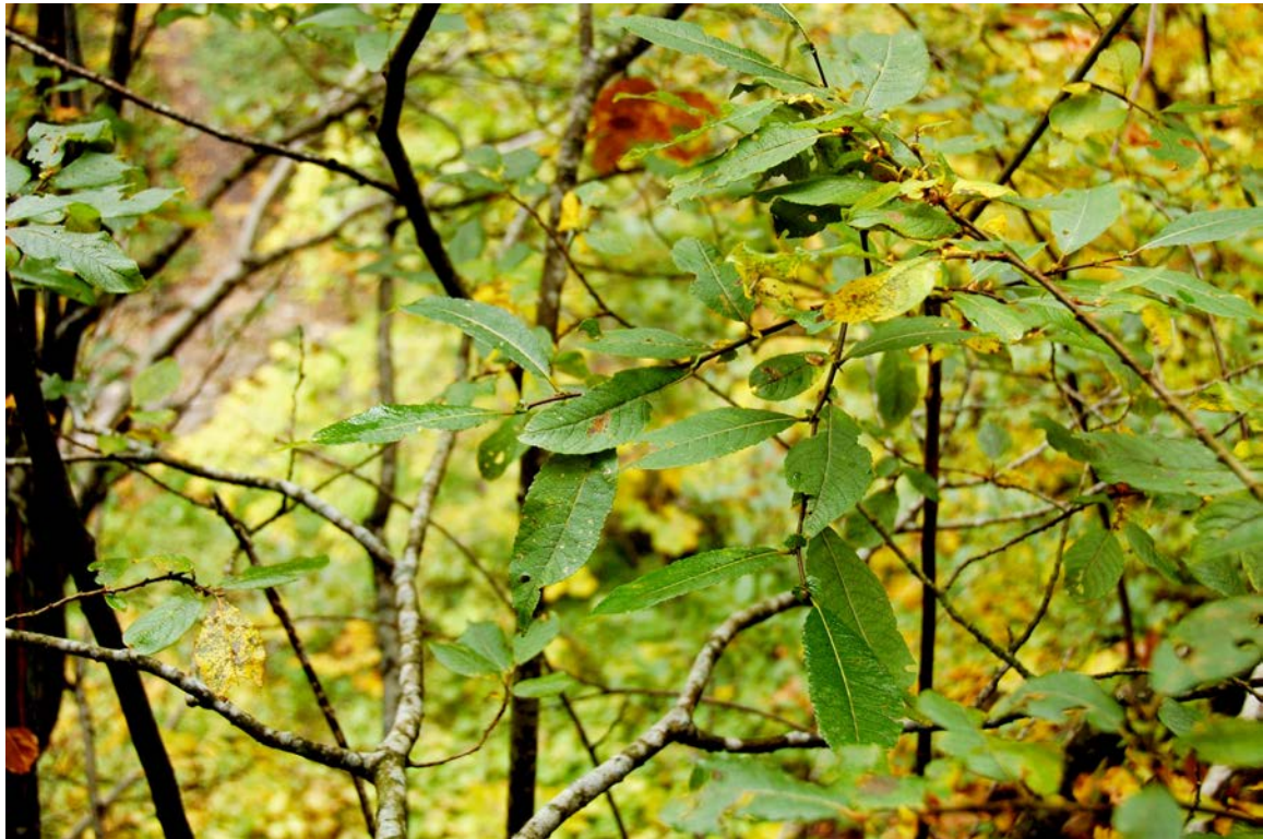
Fig. 2. Leaves of Salix appendiculata. 04.10.2017