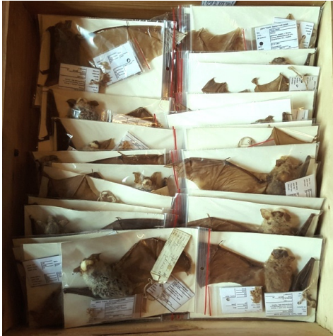
Fig. 1. Fragment of the collection of order Chiroptera in the scientific zoological repositories.

Рис. 1. Фрагмент колекції ссавців ряду Chiroptera в наукових фондах музею.