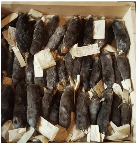
Fig. 3. Fragment of the collection of Talpa europaea in the scientific zoological repositories.

Рис. 2. Фрагмент колекції зразків родини Erinaceidae в наукових фондах музею.