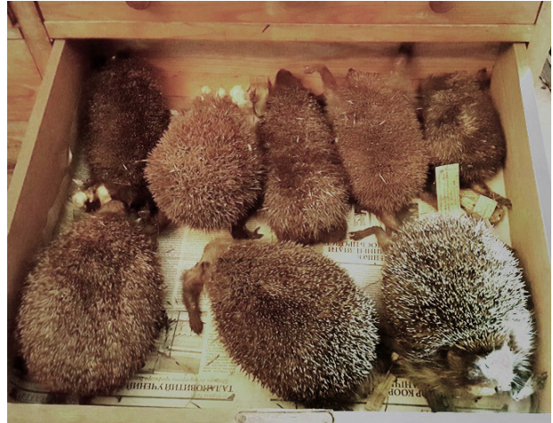
Fig. 2. Fragment of the collection of family Erinaceidae in the scientific zoological repositories.

Рис. 1. Фрагмент колекції ссавців ряду Chiroptera в наукових фондах музею.