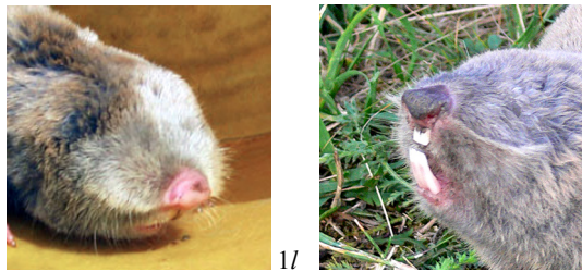
Fig. 1. Differences between Nannospalax leucodon (l) and Spalax zemni (z) by the color of rhinarium.