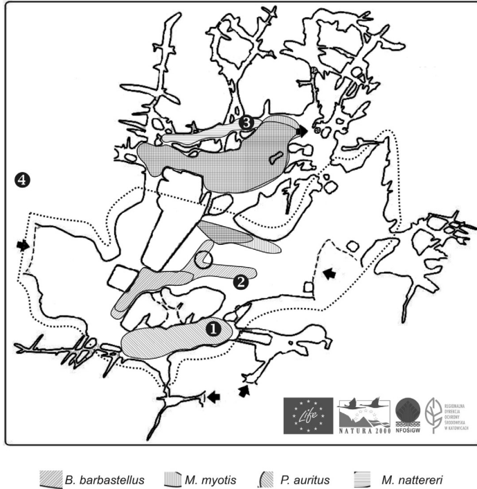
Fig. 1. The scheme of the Szachownica cave (after: Zygmunt, 2016).

Arrows – entrances, dashed line – the area with dynamic microclimate and under the threat of collapse.