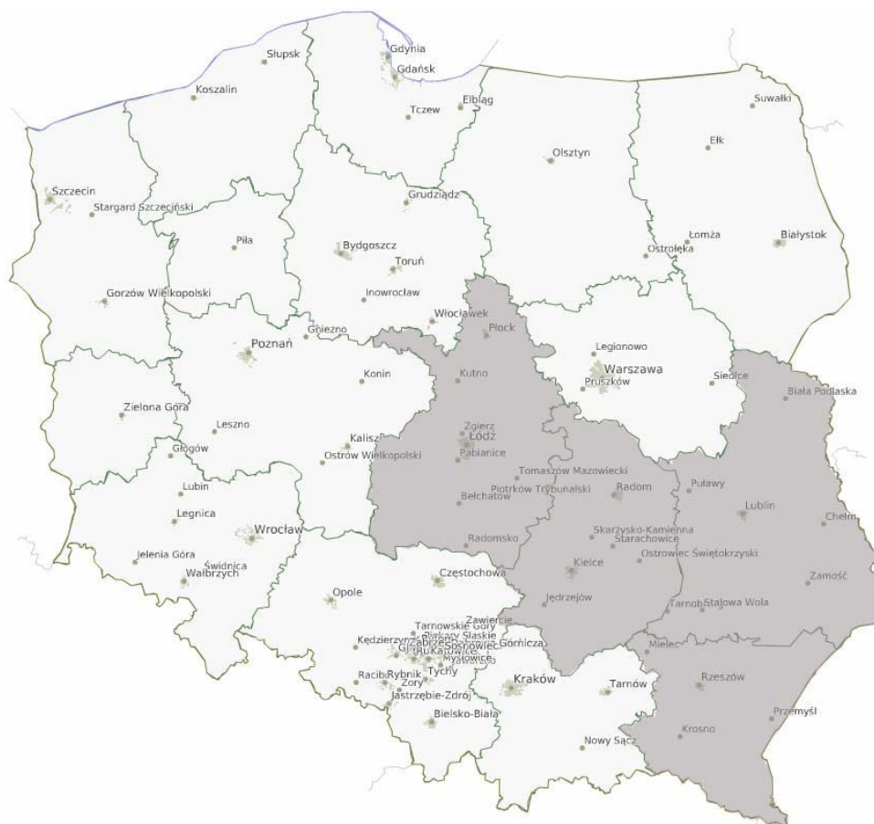
Fig. 3 – A map of areas with the highest threat from scarab beetles in Poland on which mechanical and aerial treatments against cockchafer adults were performed in 2007