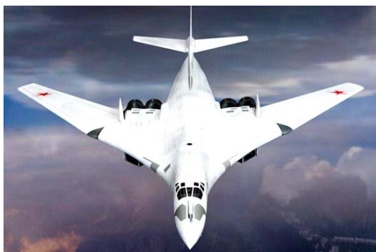
Fig. 10. Russian jet four-engine strategic bomber of the Tu-160 type («White Swan» in NATO countries terminology) developed by the Design Bureau named after A.N. Tupolev (1984, chief designer – V.I. Bliznyuk) [6]

The personification of the Russian aviation power is currently the supersonic jet strategic bomber-missile carrier of the Tu-160 type (Fig. 10), developed in the 1980s in the Design Bureau named after A.N. Tupolev [12]. This aircraft is equipped with a variable sweep wing. It is able to carry cruise missiles with a thermonuclear charge. The aircraft of the Tu-160 type has been in service since 1984. A total of 35 such aircrafts were built. As of 2013, the Russian Air Force contained 16 Tu-160 type aircrafts [12]. It became Russia's response to the US military program AMSA within which the famous American strategic bomber of type B-1 «Lancer» was created [6, 12].