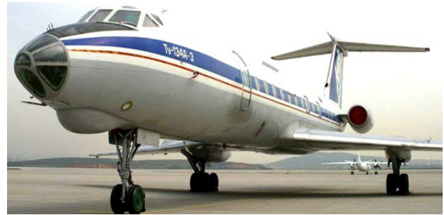
Fig. 7. Soviet mid-range twin-engine jet passenger aircraft of the Tu-134 type developed by A.N. Tupolev (1967) [6]

A.N. Tupolev, appointed in 1956 as the General Designer of the Design Bureau-156 of the Ministry of Aviation Industry of the USSR, developed short-haul jet passenger aircrafts such as the Tu-110 (1957) and Tu-124 (1960), as well as a supersonic jet bomber of the Tu-22 type (1959) [5]. Then A.N. Tupolev and his colleagues at the Design Bureau actively continued work on the development of a turboprop strategic bomber of the Tu-95 type for long-range aviation (Fig. 8), which became a separate bright «page» in the scientific and technical biography of this scientist [11].