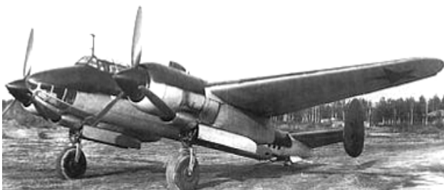
Fig. 4. Soviet propeller twin-engine front dive bomber of Tu-2 type developed by A.N. Tupolev in the prison Central Design Bureau-29 of the NKVD of the USSR (1941) [5]

The main tactical and technical characteristics of the aircraft of type Tu-2 with two-tail unit [5]: flight range – 2020 km; maximum take-off weight – 11767 kg; take-off weight without combat cargo – 7601 kg; maximum flight speed at an altitude – 521 km/h; two piston air-cooled engines, brand AIII-82, with a power of 1,700 hp; lifting ceiling (height) – 9000 m; length – 14 m; crew – 3 people Tu-2 type front bomber made the first flight on January 29, 1941. The serial production of this aircraft began in 1942 and lasted until 1952. A total of 2649 units of this bomber were manufactured in the USSR [5]. This plane was one of the best machines of its time.