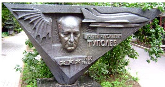
Fig. 11. The tombstone of the great aircraft designer of the 20th century, three times Hero of Labor A.N. Tupolev (Novodevichy cemetery, Moscow, 2012; sculptor – G. Toidze) [14]