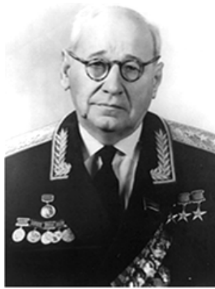
Fig. 1. Outstanding Soviet aircraft designer, three times Hero of Labor, Doctor of Technical Sciences, Academician of the Academy of Sciences of the USSR Andrey Nikolaevich Tupolev (November 10, 1888 - December 23, 1972) [3]