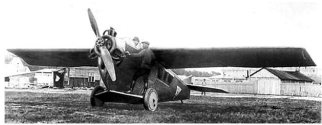
Fig. 2. One of the first all-metal Soviet propeller-piston aircrafts of type ANT-2 designed by the young aircraft designer A.N. Tupolev (1924) [5]

Thus, step by step, in CAHI, production and design teams were formed, aimed at creating in the USSR a new aviation technology, which the army and society as a whole needed.