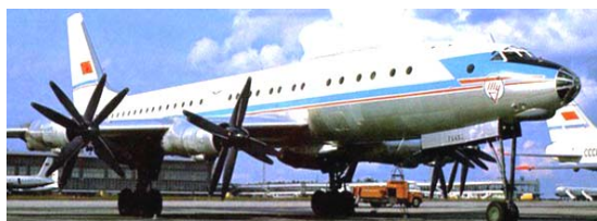
Fig. 9. Soviet long-distance (intercontinental) turboprop four-engine passenger aircraft of the type Tu-114 developed by A.N. Tupolev (1958) [6]

During the years of operation, Tu-114 aircraft delivered 32 world records and there is no data in the column of flight incidents with these aircraft [5].