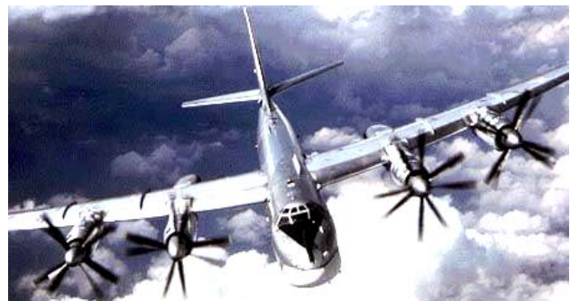
Fig. 8. Soviet turboprop four-engine strategic bomber of the Tu-95 type («Atomic Bear» in the terminology of NATO countries) developed by A.N. Tupolev and his fellow aircraft designers at the Design Bureau-156 (1956) [7, 8]

A surprising fact about aviation is the fact that a strategic bomber of the Tu-95 type (this «flying fortress» with several thermonuclear charges on board [7, 8]), developed and created under the guidance of A.N. Tupolev, more than 60 years ago, is still in the combat «ranks» of the Russian Air Force and provides its defenses in the airspace. Such examples of «longevity» in aviation technology are extremely few. In this regard, only our domestic passenger single-engine propeller airplane type AN-2 with a piston engine, developed in 1947 by the outstanding Ukrainian aircraft designer Oleg Konstantinovich Antonov [5], can compare with the military Tu-95.