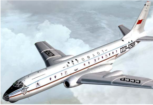
Fig. 6. One of the first in the world Soviet jet multi-passenger aircraft of the Tu-104 type («Russian camel» in the terminology of the NATO countries) developed by A.N. Tupolev (1956) based on a Tu-16 type combat aircraft [6]