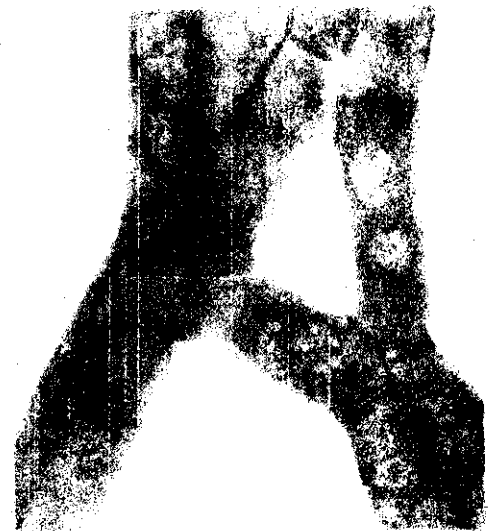
Fig. 7. Cell agglomerations of a lysing type mutant Fig. 8. Nucleoids in lysing mutant cells

a confluent lawn of wild type cells. Such a peculiarity is a very interesting one because any other E. coli mutants in mixed inocula with wild type cells do not form separate colonies. The lysing mutant selective advantage comparing to wild type bacteria correlates with its growth rate and its other growth characters in the liquid medium.