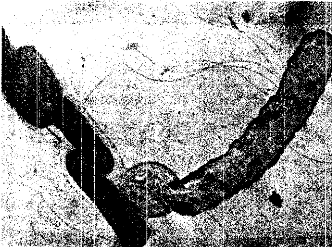
Fig. 5. Cells of a granular type mutant