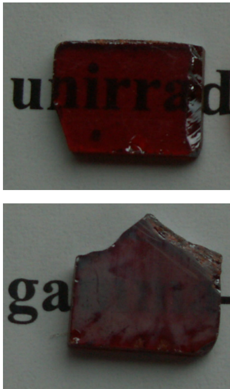
Fig. 1. Photos of g-As 2 S 3 samples in the unirradiated (top) and \gamma -irradiated (bottom) states. The white oxidized layer at the surface of \gamma -irradiated sample is visible to the eye (see the text for details).

Unfortunately, it is not possible to perform in-situ experiment in the case of \gamma -irradiation, and, thus, the impact of oxidation processes in \gamma -irradiated g-As 2 S 3 cannot be excluded during measurements. The radiation-induced oxidation results in formation of oxidized layer, but using mechanical treatment, when \gamma -irradiated sample is washed and polished, this oxidized layer can be removed [1]. One of the methods to verify its removing is measurement of optical transmission spectrum in the fundamental optical absorption edge region. No significant changes in saturation region of optical transmittance between the \gamma -irradiated and annealed (in sense as unirradiated) samples would be a signature on the disappearance of oxidized layer (see Fig. 2 [1]).