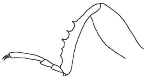
Fig. 2. Revelieria groehni sp. n., fore leg.