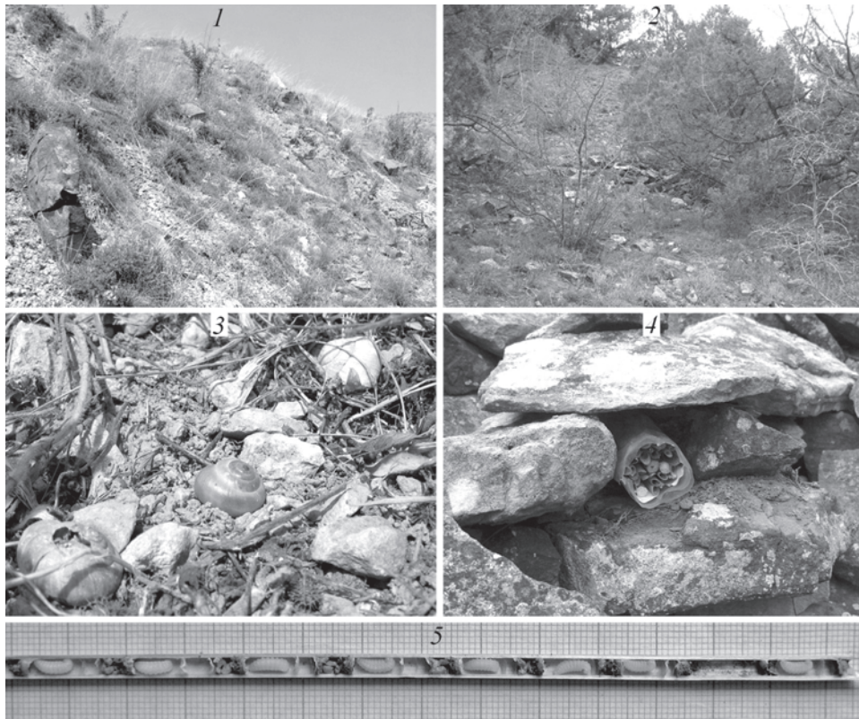
Fig. 1. Nesting of Leptochilus alpestris and L. regulus : 1 — nesting site of L. alpestris in Lisy Bay; 2 — nesting site of L. regulus in Karaul-Oba Mountain; 3 — shell of Monacha fruticola with the nest of L. alpestris under a stone; 4 — trap-nest with the nest of L. regulus ; 5 — dissected reed stem with the nest of L. regulus .

Рис. 1. Гнездование Leptochilus alpestris и L. regulus : 1 — станция гнездования L. alpestris в Лисей бухте; 2 — станция гнездования L. regulus на горе Караул-Оба; 3 — раковина Monacha fruticola с гнездом L. alpestris под камнем; 4 — искусственная гнездовая конструкция с гнездом L. regulus ; 5 — вскрытый стебель тростника с гнездом L. regulus .